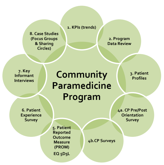
Figure 1. Data Collection

Primary data captured for this final report (up to January 30, 2019) derives from those respondents who meet the following criteria: