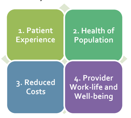
Figure 1. Quadruple Aim projects contribute to improvement in four areas, as below: